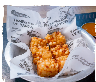
TAPIOCA AND CHEESE CUBES

#4 BIG BREADED SHRIMPS STUFFED WITH CATUPIRY CHEESE R$57,90