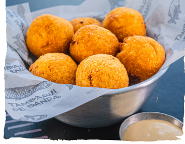
ALL FISH BALLS COME WITH TUCUPI MAYO

FISH BALLS 10 UNITS TAMBAQUI R$27,90 PIRARUCU R$33,90