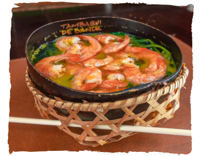
TACACÁ FROM THE NORTH OF BRAZIL. TUCUPI SAUCE, GUM OF YUCA, DRIED SHRIMP AND JAMBU LEAVES R$33,90