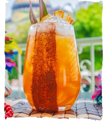
CAŅELA de ÍNDIA

GLASS 450ML R$17,90 FRUIT SYRUP AND CARBONATED WATER. CHOOSE FLAVOR: GUARANÁ, LEMON, PINEAPPLE, ACEROLA, CUPUAÇU, GUAVA, TAPEREBÁ, SOURSOP, MANGO OR PASSION FRUIT.