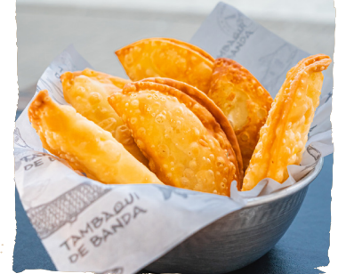
BRAZILIAN FRIED TURNOVERS

MIX THE FISH BALLS (5UN EACH FLAVOR) AND TURNOVERS (3UN EACH FLÁVOR) AND PAY PROPORTIONALLY.