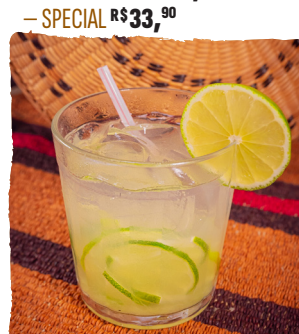
CAIPIRINHA CACHAÇA, LEMON AND SUGAR SYRUP.