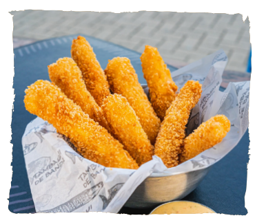
CRISPY PIRARUCU BITES

#6 CUBES MADED WITH TAPIOCA AND COALHO CHEESE AND CUPUAÇU SAUCE LIGHTLY SPICY. $ 27, 90