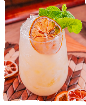
AMBUÇU de CANA

TAPEREBÁ, SUGAR SYRUP AND TONIC. GIN EURIDICE: R$32,90 GIN TANQUERAY: R$39,90