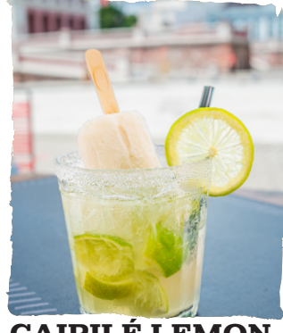
CAIPILE LEMON & GRAVIOLA

CAIPIRINHA WITH SOURSOP POPSICLE. - TRADITIONAL R$25,90