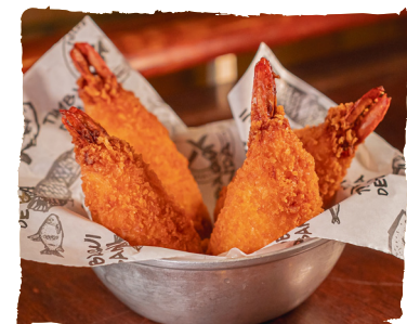
CREAM CHEESE STUFFED SHRIMP

CANAPE MADE OF DRIED PIRARUCU WITH CREAM CHEESE AND WRAPPED IN FRIED BANANAS (4UN). R$34,90