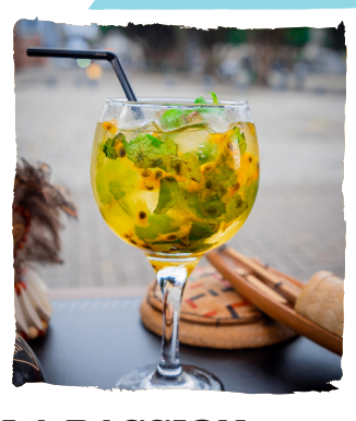
TANQUERAY GIN, PASSION FRUIT, TONIC WATER, MINT AND SUGAR SYRUP. R$46,90