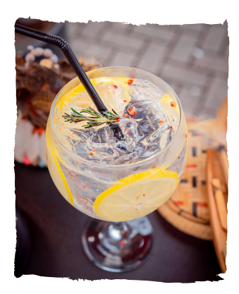
LE MAGNIFIQUE! LA PASSION TANQUERAY GIN, TONIC, LEMON, PINK PEPPER AND ROSEMARY. R$46,90