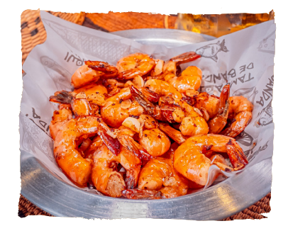
SAUTÉED GARLIC SHRIMP ANOTHER BEER FRIEND $67,90