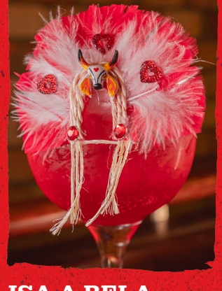
ISA A BELA GUERREIRA

GARANTIDO STRAWBERRY SYRUP, CARBONATED WATER. R$19,90