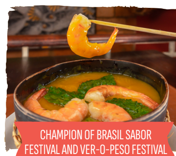
TACAQUI o NHOQUE!

GNOCCHI MADE OF TAMBAOUI, TUCUPI SAUCE, JAMBU LEAVES AND FRESH SHRIMPS. FISH GNOCCHI AS YOU NEVER TRIED BEFORE. OUR MOST AWARDED DISH! R$ 42,90